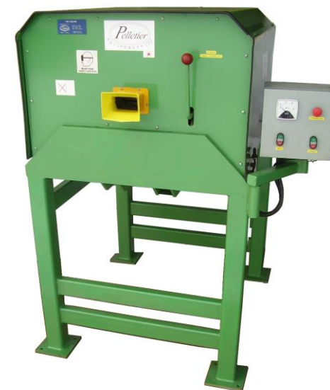
Wire & Cable Chopper Modèle 60-40

Superior quality to any world competition