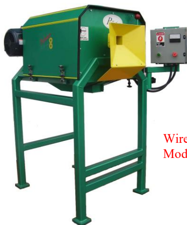
Wire & Strapping Chopper Model 60-30

Superior quality to any world competition